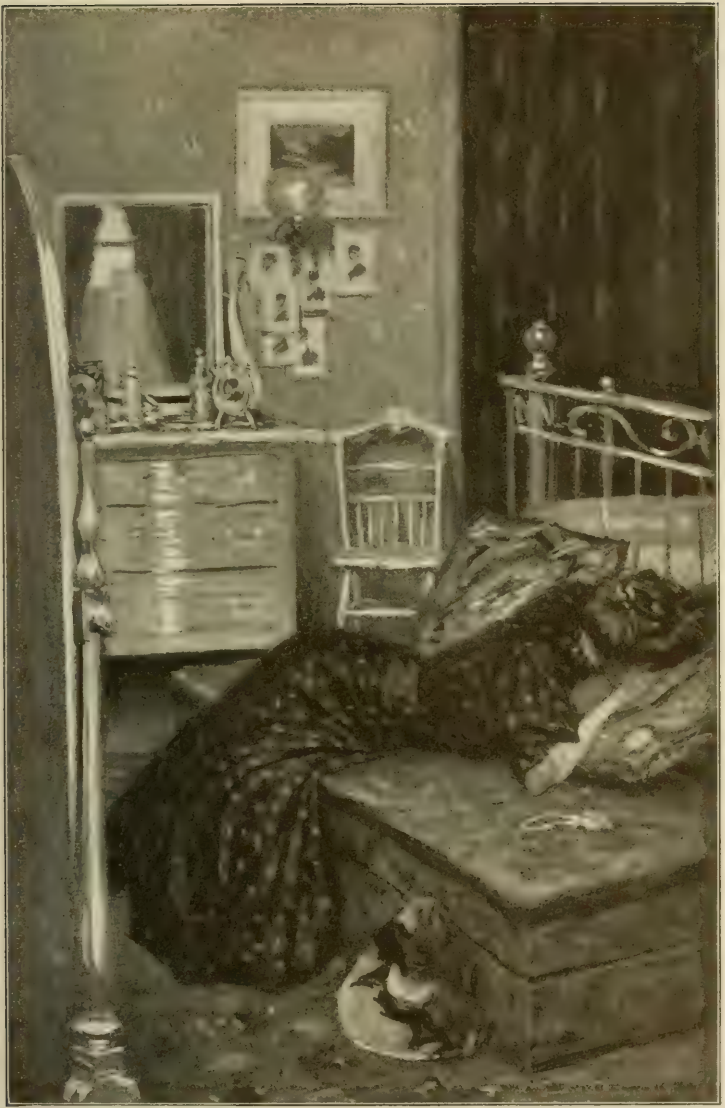
SHE YIELDED TO THE BITTERNESS